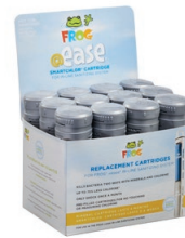
FROG @ease SmartChlor Cartridge 12pk