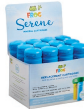
FROG Serene Mineral Cartridge 12pk