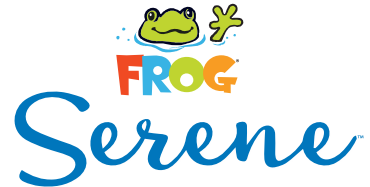
FROG Serene logo