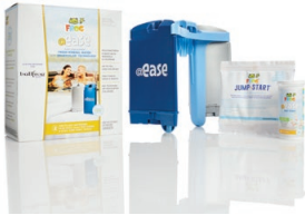
FROG @ease for Bullfrog Spas Family