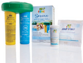
FROG Serene Floating Family