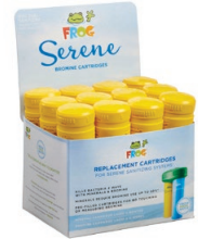
FROG Serene 150gm Bromine Cartridge 12pk