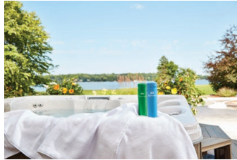
FROG Serene In-Line Cartridges on towel