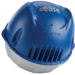
FROG @ease Floating System