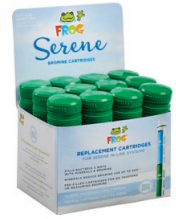
FROG Serene 200gm Bromine Cartridge 12pk