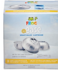
FROG @ease SmartChlor 3pk Carton