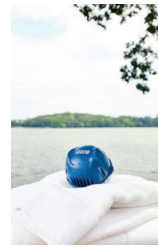
FROG @ease on towel