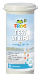
FROG Test Strip Bottle