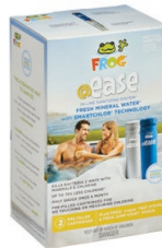
FROG @ease In-Line System Carton