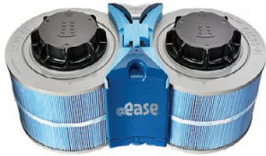
FROG @ease for Bullfrog Spas installed