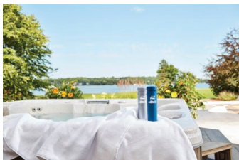
FROG @ease In-Line Cartridges on towel