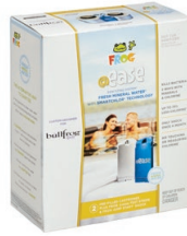
FROG @ease for Bullfrog Spas System Carton