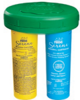
FROG Serene Floating System