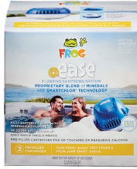
FROG @ease Floating System Carton