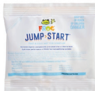
FROG Jump Start packet