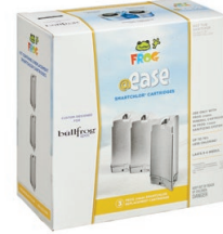
FROG @ease for Bullfrog Spas SmartChlor 3pk