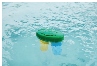
FROG Serene floating in hot tub