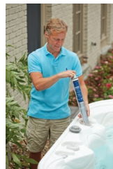
Snapping SmartChlor Cartridge into holder