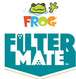
FROG Filter Mate logo

As we continue to rebrand our FROG product line, new logos will be added to this guide.