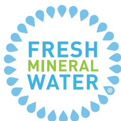
Fresh Mineral Water logo