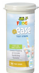
FROG @ease Test Strip Bottle