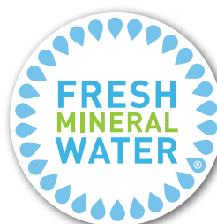
Fresh Mineral Water logo in white circle