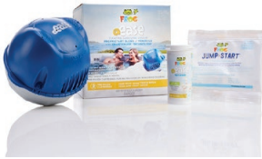
FROG @ease Floating Family