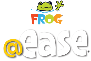
FROG @ease logo