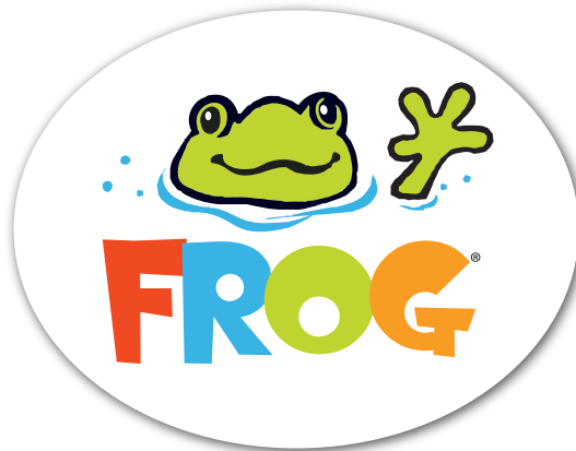
FROG logo in white oval