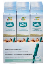
FROG Filter Mate 12pk