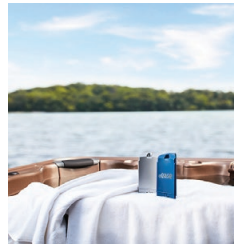
FROG @ease for Bullfrog Spas on towel