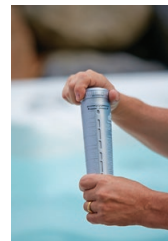
Inserting FROG @ease In-Line holder